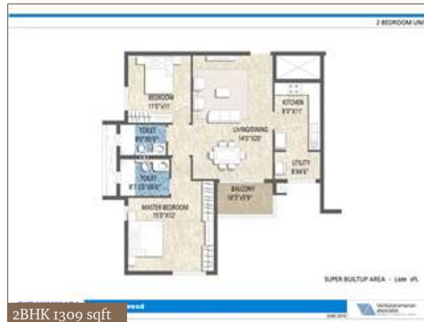
2BHK 1309 sqft