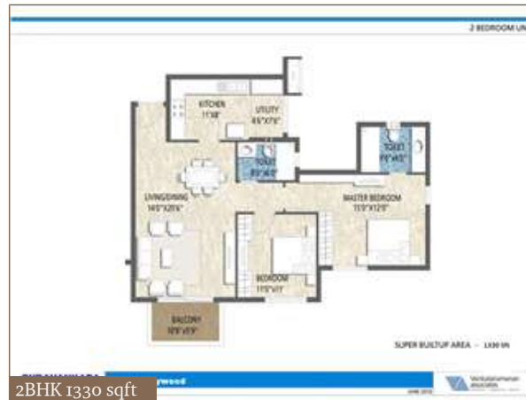
2BHK 1330 sqft

Amphitheatre, Cricket Pitch, Skating Rink, Meditation / Aerobic Room, Squash Court, Billiards/Pool Table, Table Tennis, Jogging Track, Aroma Garden, Gymnasium, Old Folks' Corner, Steam & Sauna, Jacuzzi, Swimming Pool/Toddlers Pool, Provision for Creche, Provision for Super Market, Party Hall, Provision for Restaurant, Basketball Court (Mini Court), Outdoor Multi-Purpose Court ( Volleyball/ Badminton Court ), Outdoor Children's Play Area, Well-Lit Landscaped Garden, Water Purification Plant, Fire Protection System, Sewerage Treatment Plant, Organic Waste Converter.