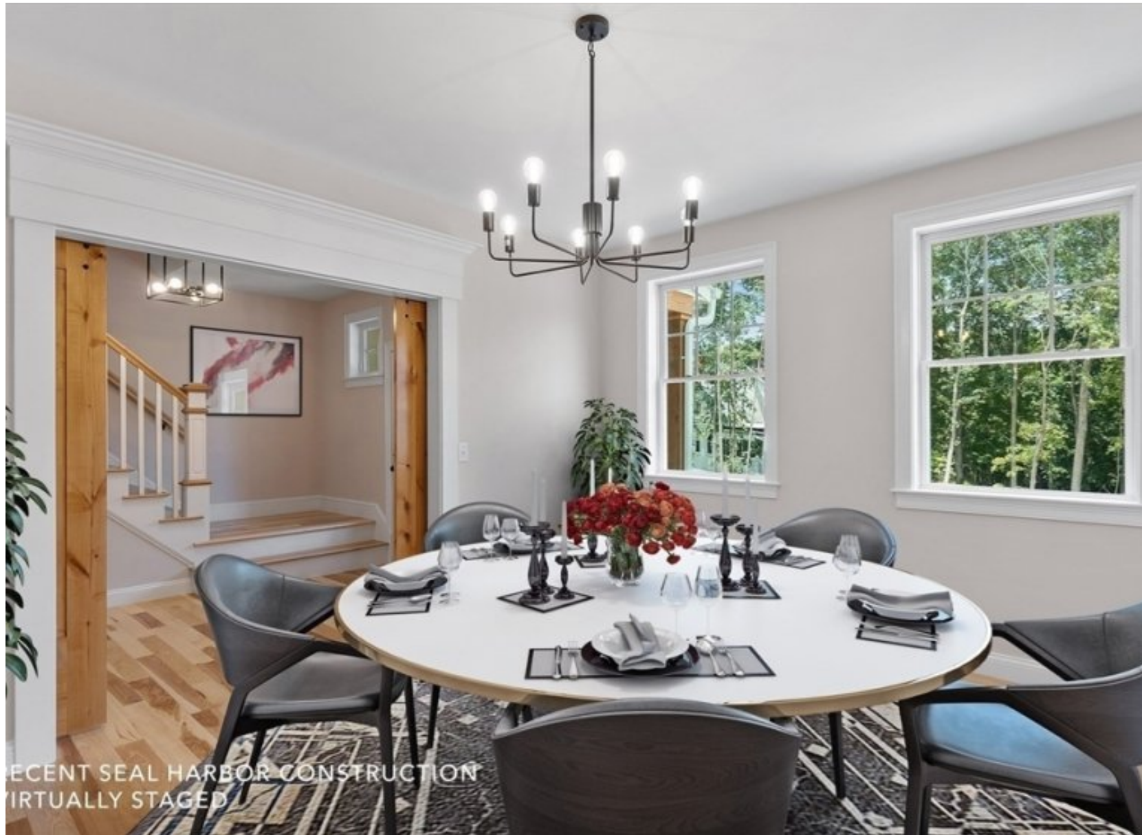
RECENT SEAL HARBOR CONSTRUCTION VIRTUALLY STAGED