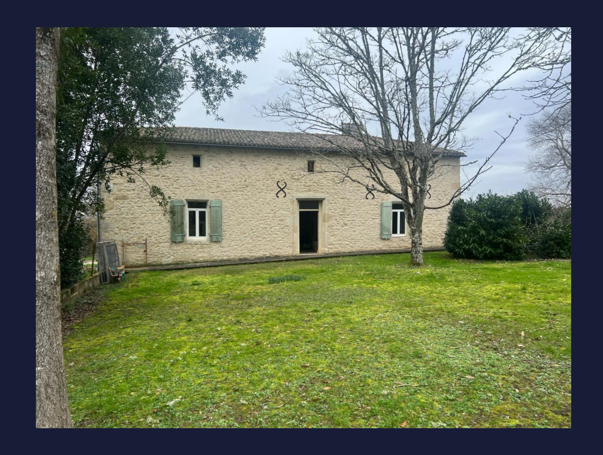
Pellegrue, Gironde, France