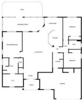
FLOOR PLAN CREATED BY COMPLEXITY. ANY PHOTOGRAPHS TO DISPLAY MUST BE TAKEN BY THE TIME OF VISIT.