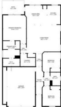
FLOOR PLAN CRAFTED BY CONCEPTUAL ART PROGRAMMERS TO EXPRESS IDEAS; NOT TO BE CONSIDERED AS A CONTRACT.