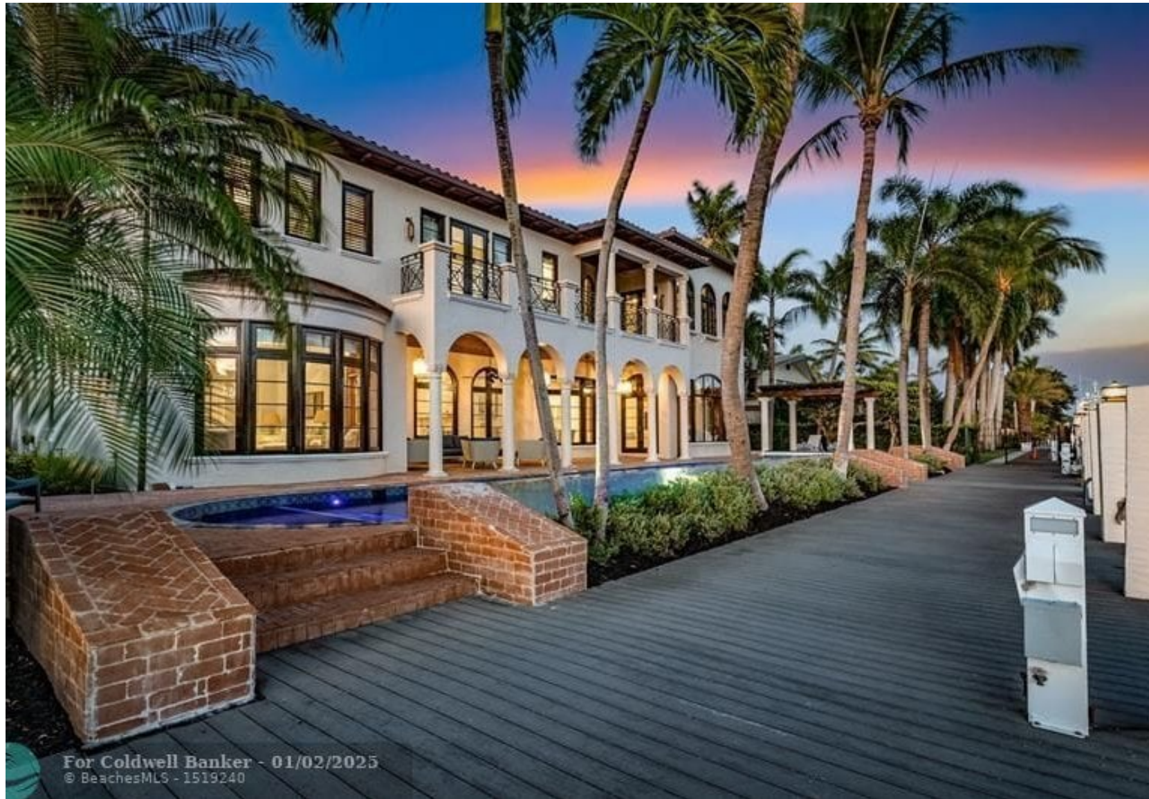
For Coldwell Banker - 01/02/2025 © BeachesMLS - 1519240