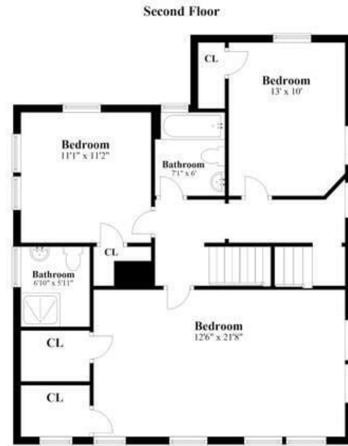
Floor Plan measurements are approximate and are for illustrative purposes only. Plan produced using PlanUp.