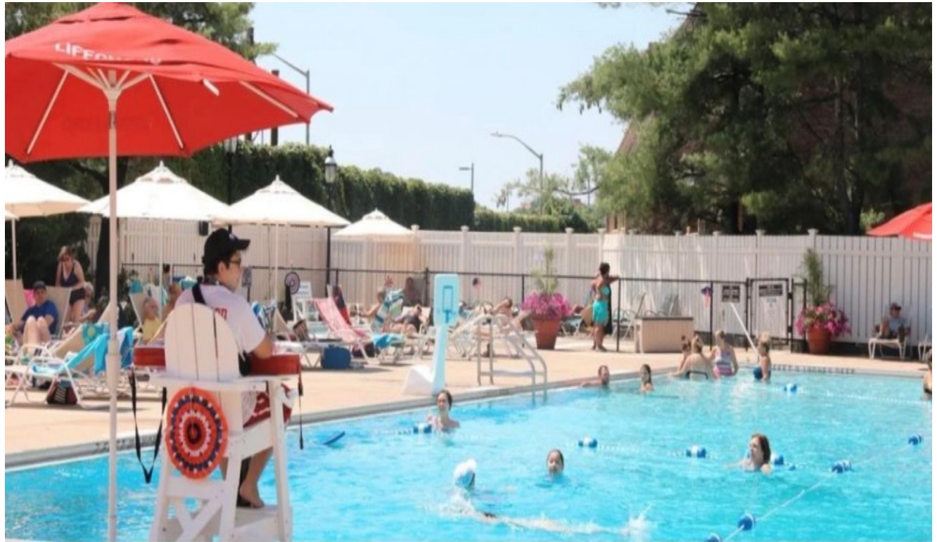
Outdoor Swimming Pool