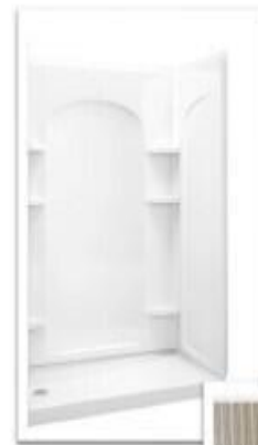
Fiberglass Shower – Primary & Fiberglass Tub/Shower – Bath 2