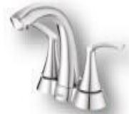
MASON CHROME BATH ACCESSORIES