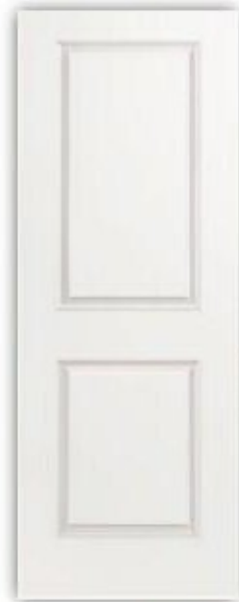
2 Panel Square Interior Doors