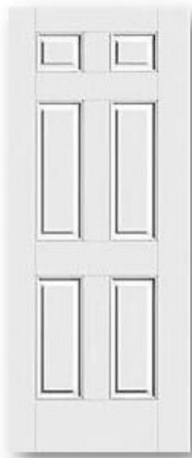
Front Entry Door