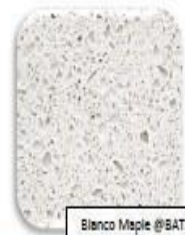
Blanco Maple @BATHROOMS