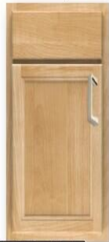
ARISTOKRAFT Sinclair Natural