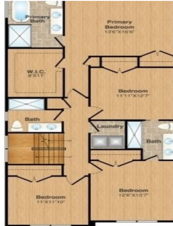
151 Center Ave - Second Floor