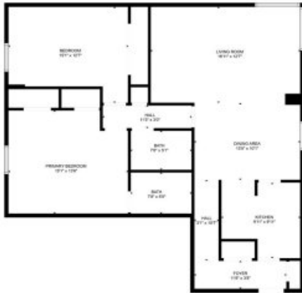
FLOOR PLAN DIMENSIONS BY CONCRETE AREA FROM APPROXIMATE DIMENSIONS. DIMENSIONS ARE APPROXIMATE. DIMENSIONS ARE APPROXIMATE. DIMENSIONS ARE APPROXIMATE.