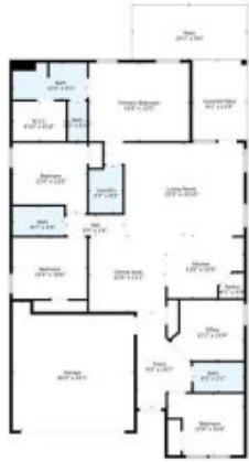
MEASUREMENTS ARE APPROXIMATE