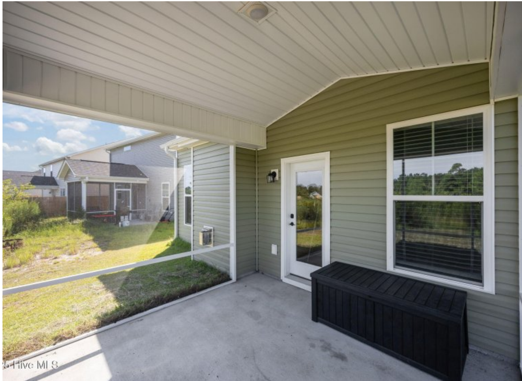
5-Hive MI 9