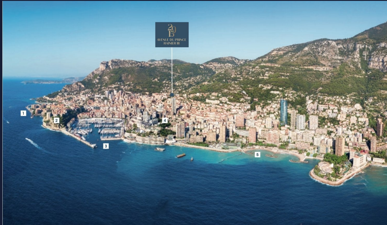
1 Port and business district of Fontvieille | 2 The Rock and the Prince's Palace | 3 Port Hercules | 4 The Place du Casino and the Opéra Garnier | 5 Larvotto Beach