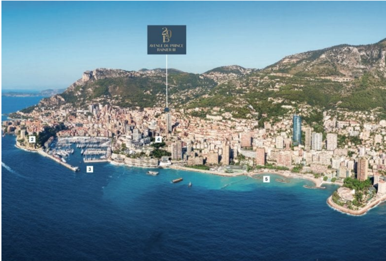
business district of Fontvieille | 2 The Rock and the Prince's Palace | 3 Port Hercules | 4 The Place du Casino and the Opéra Garnier | 5 Larvotto