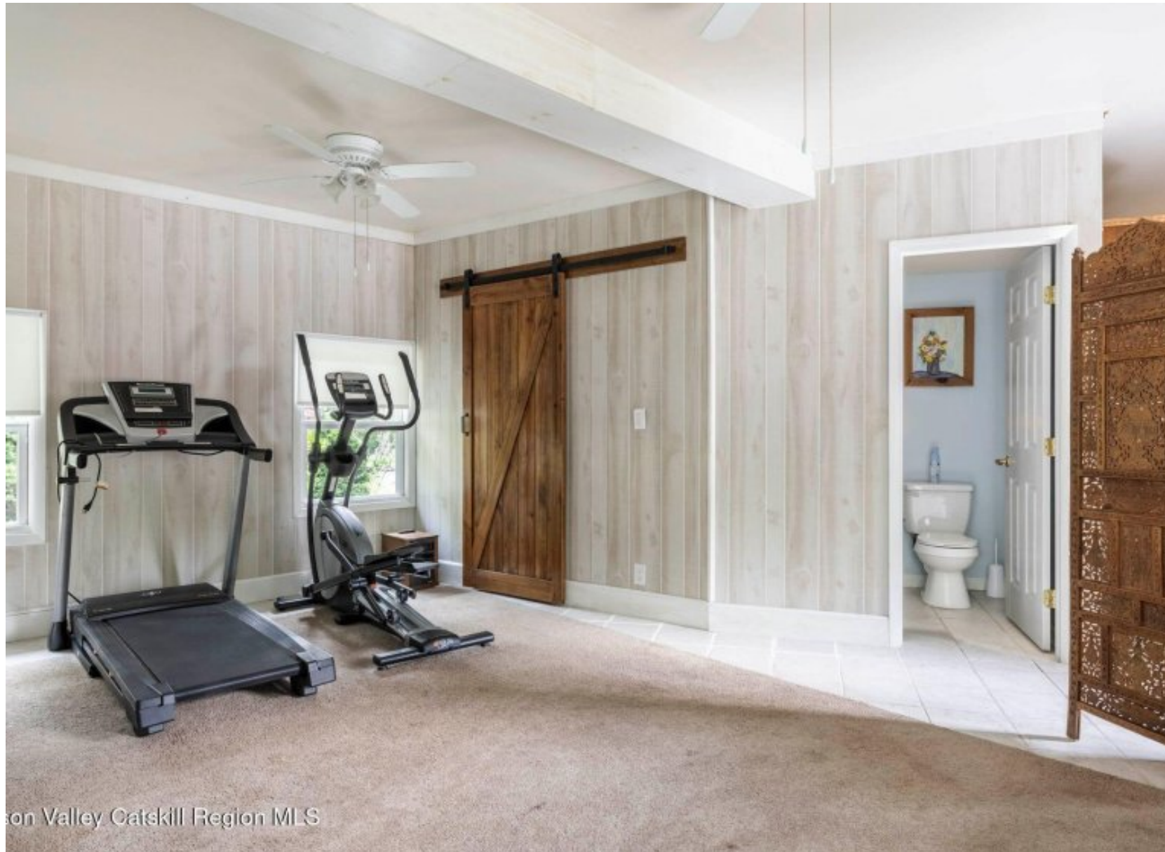
son Valley Catskill Region ML S