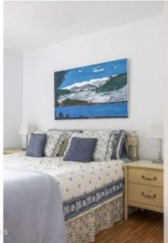
Hudson Valley Catskill Region M/S