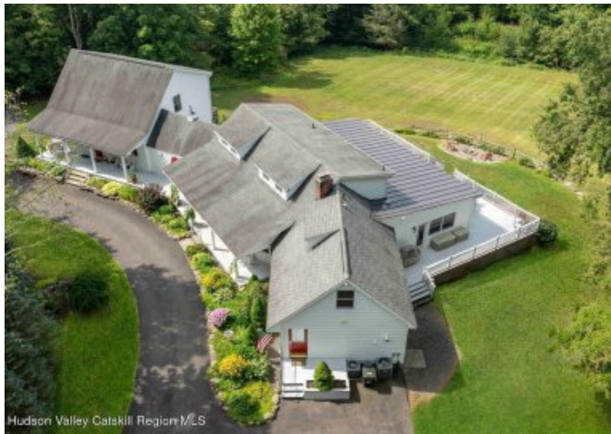
Hudson Valley Catskill Region M/S