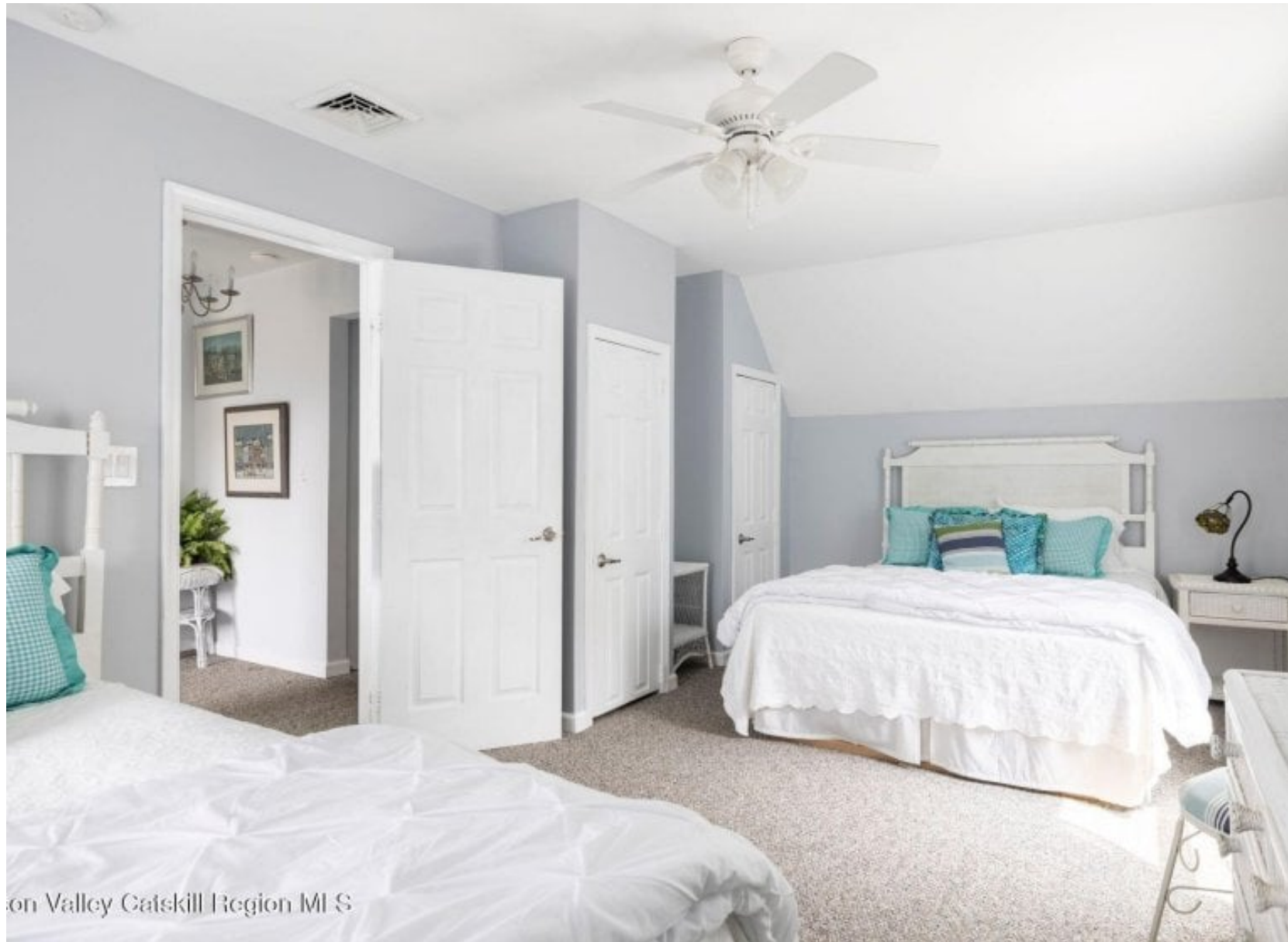
on Valley Catskill Region MI S