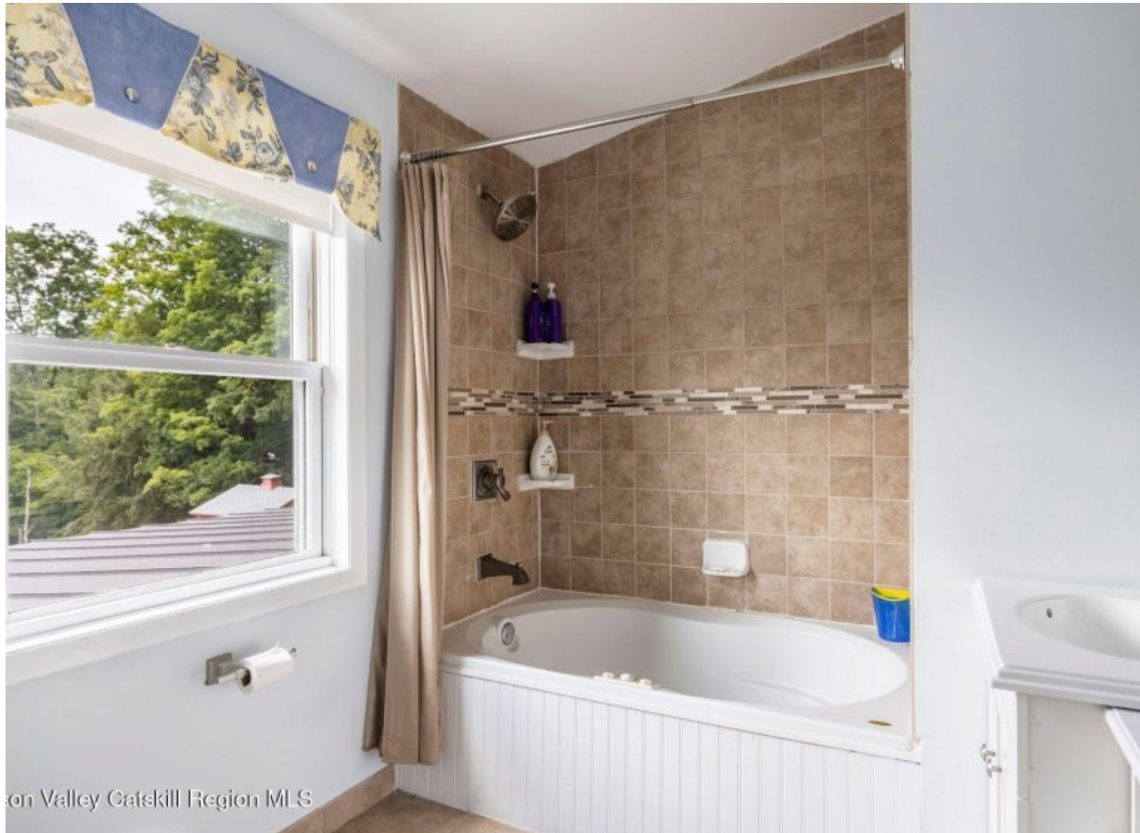
son Valley Catskill Region MI S