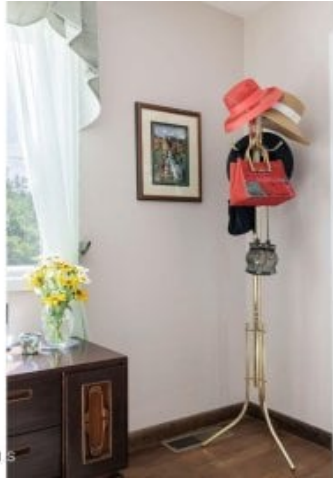
Hudson Valley Catskill Region MLS