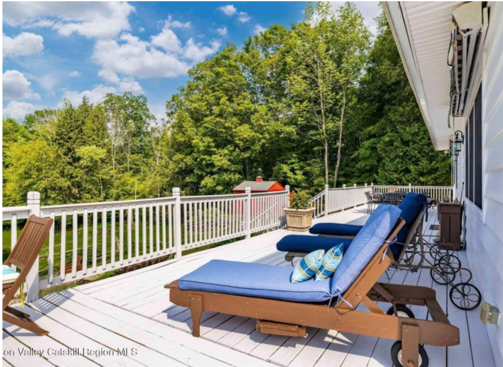
on Valley Catskill Region MI S