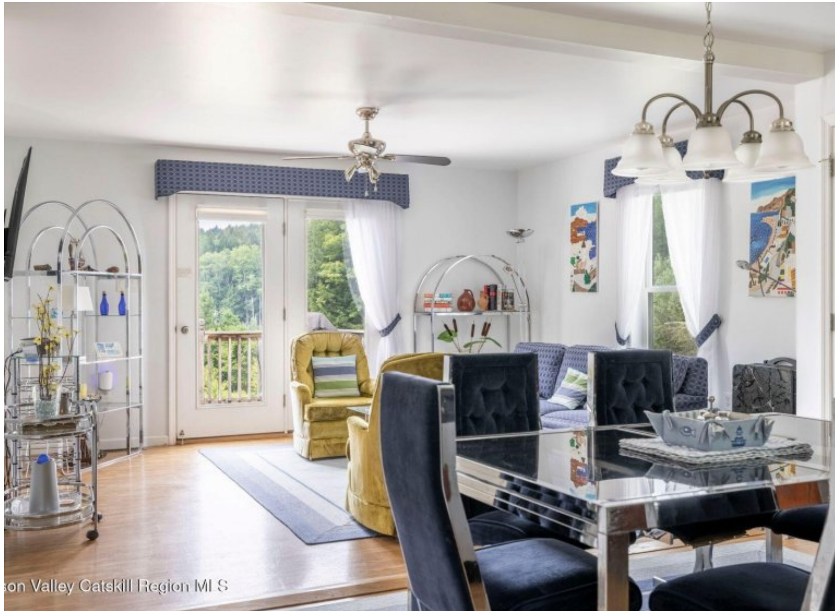
son Valley Catskill Region MI S