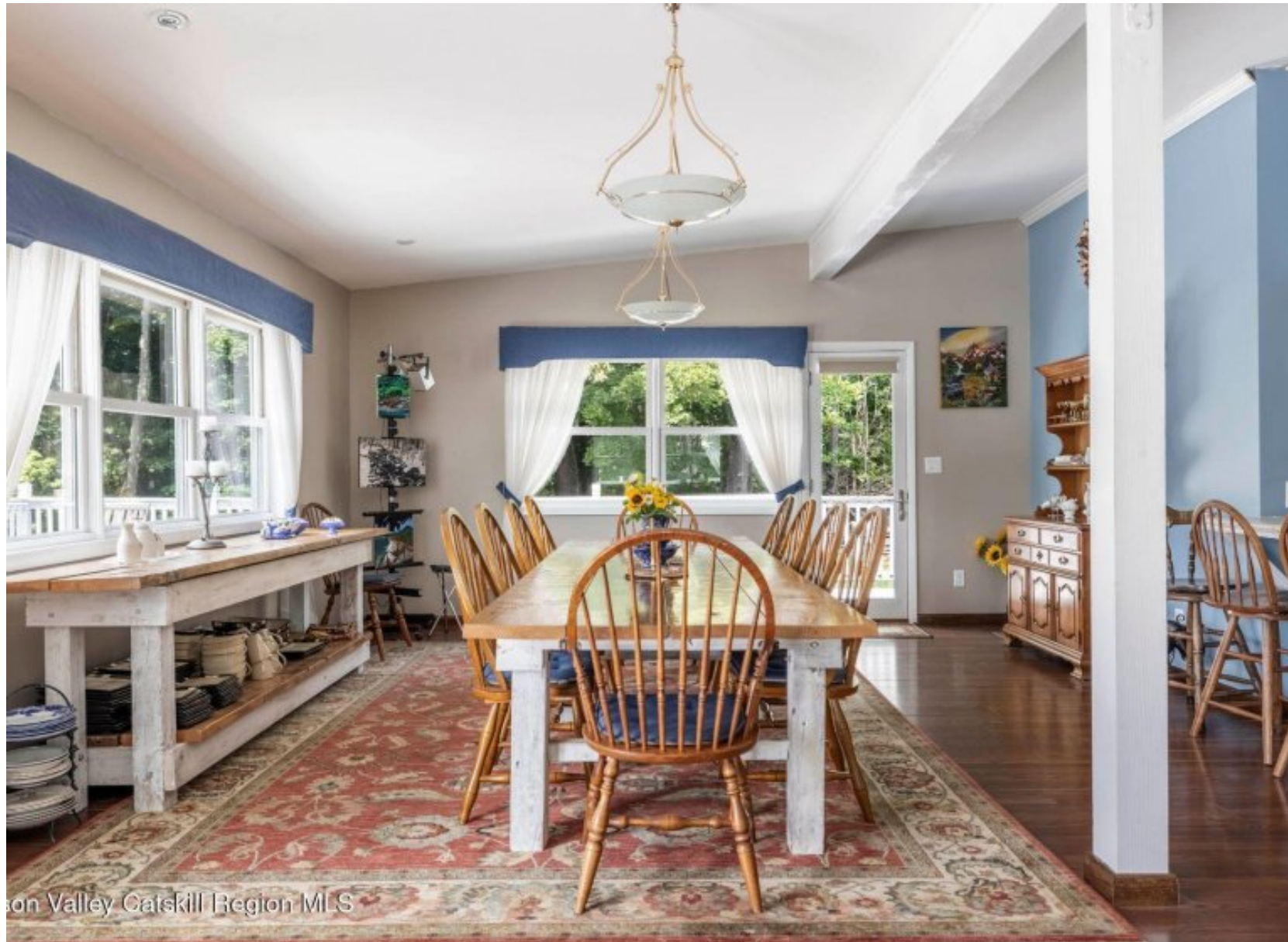
son Valley Catskill Region MI S