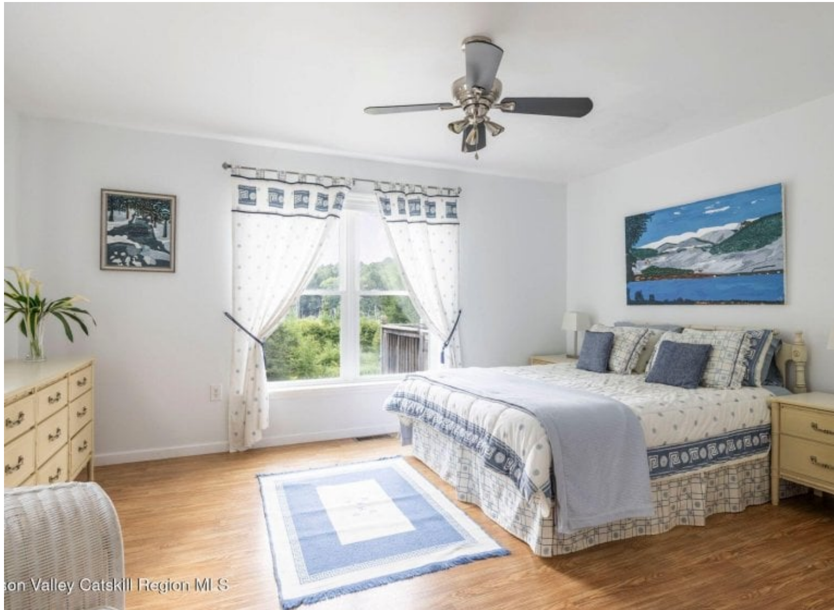
son Valley Catskill Region MI S