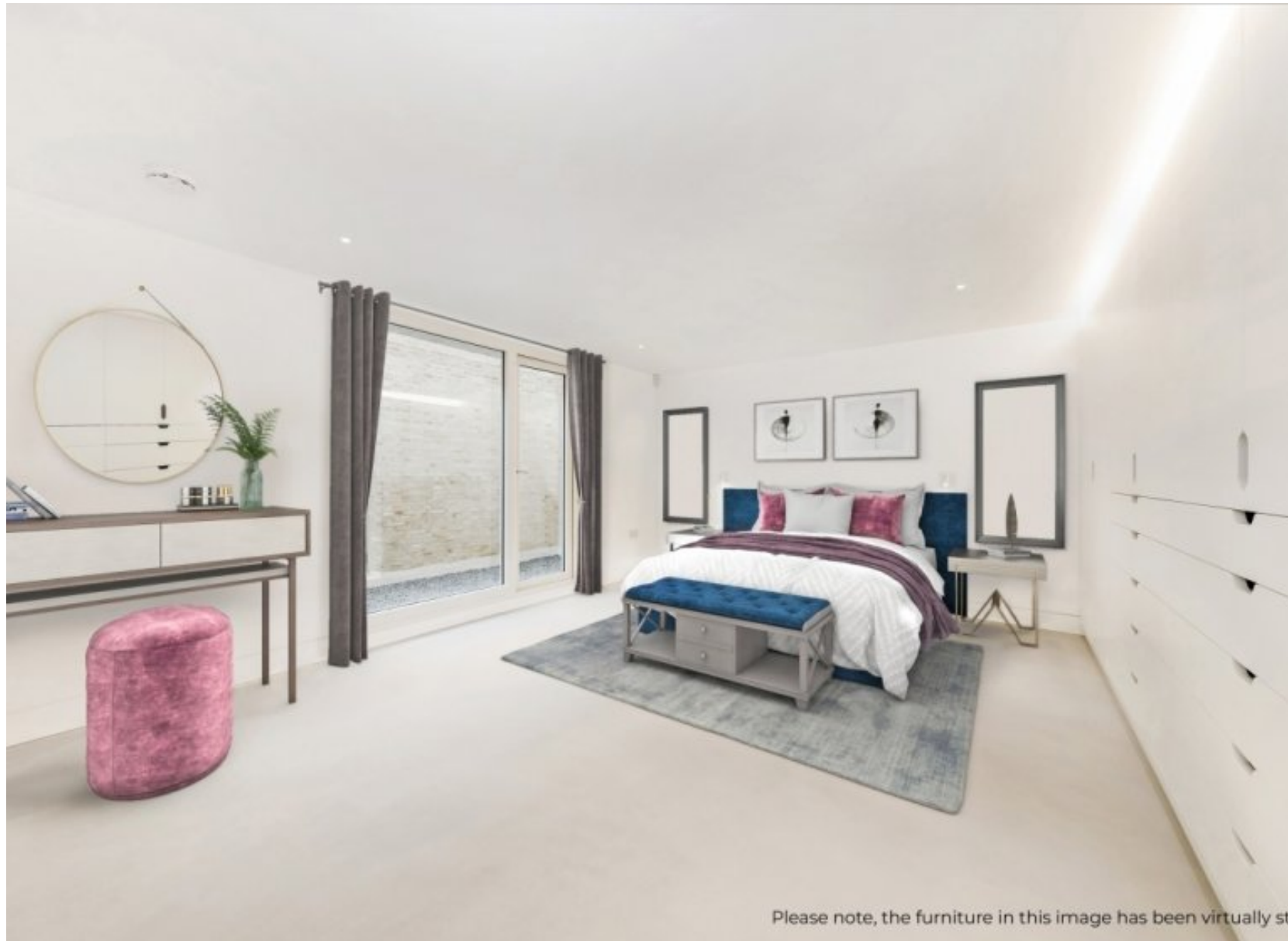
Please note, the furniture in this image has been virtually staged.