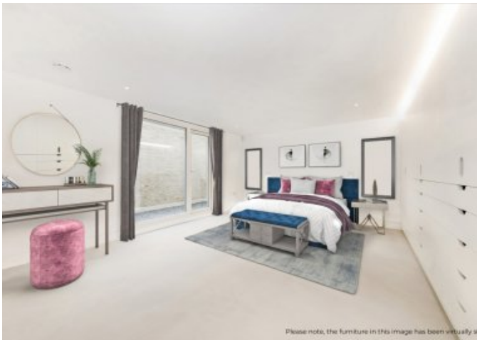
Please note, the furniture in this image has been virtually added