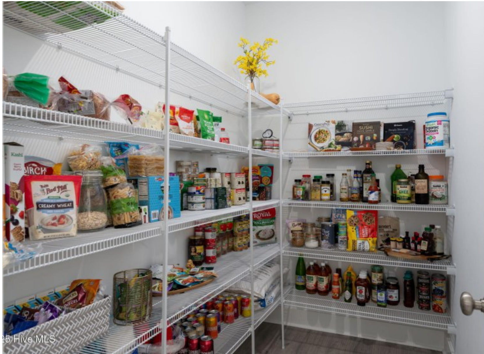
25 Five MLS