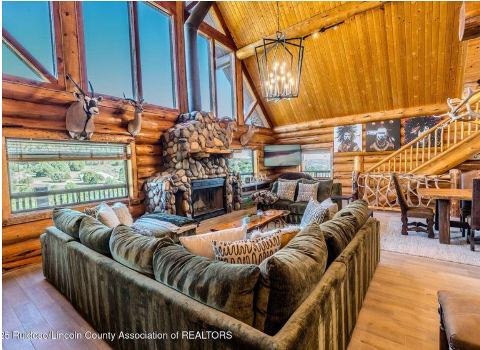
25 Ruidoso/Lincoln County Association of REALTORS