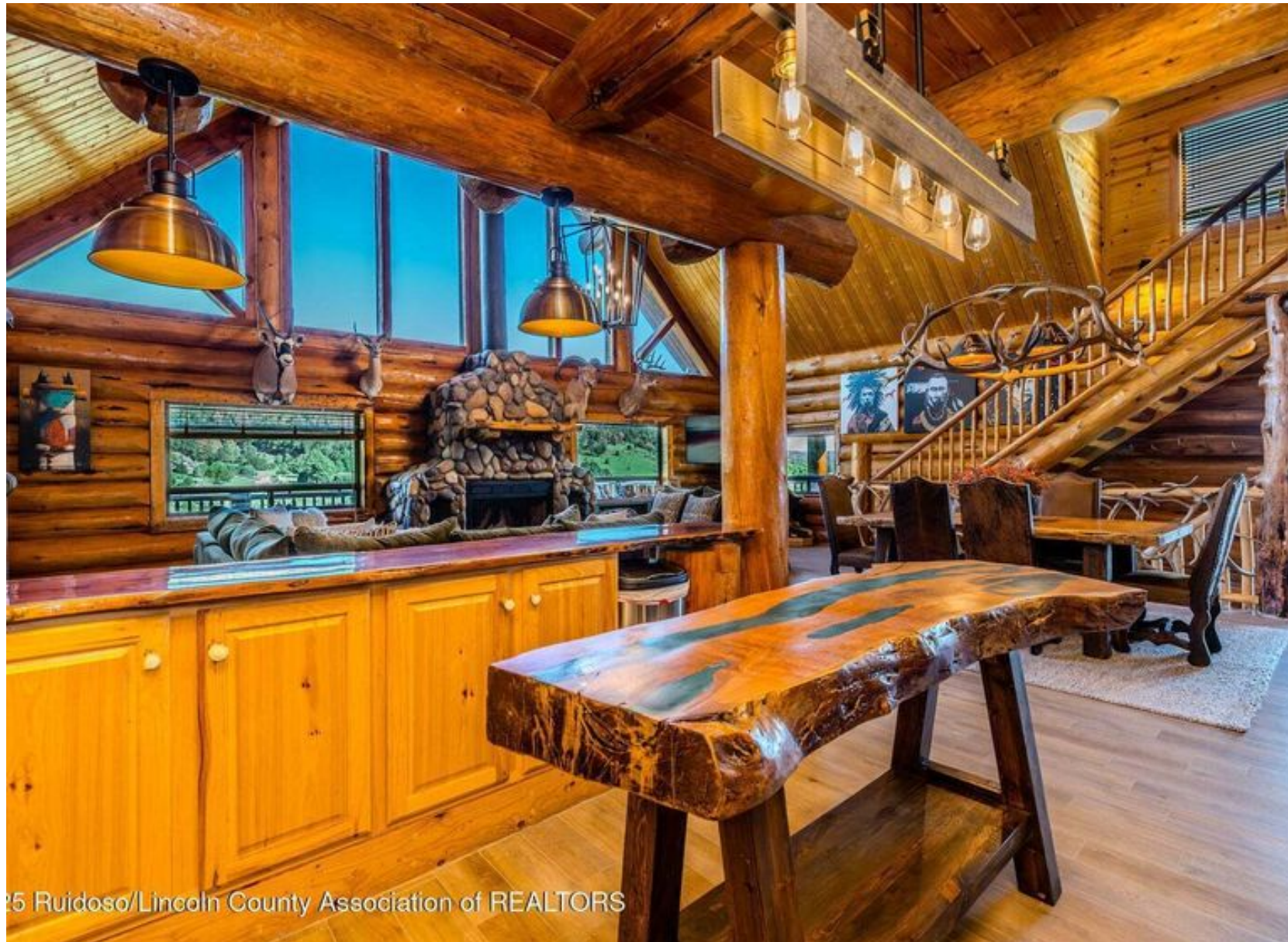
25 Ruidoso/Lincoln County Association of REALTORS