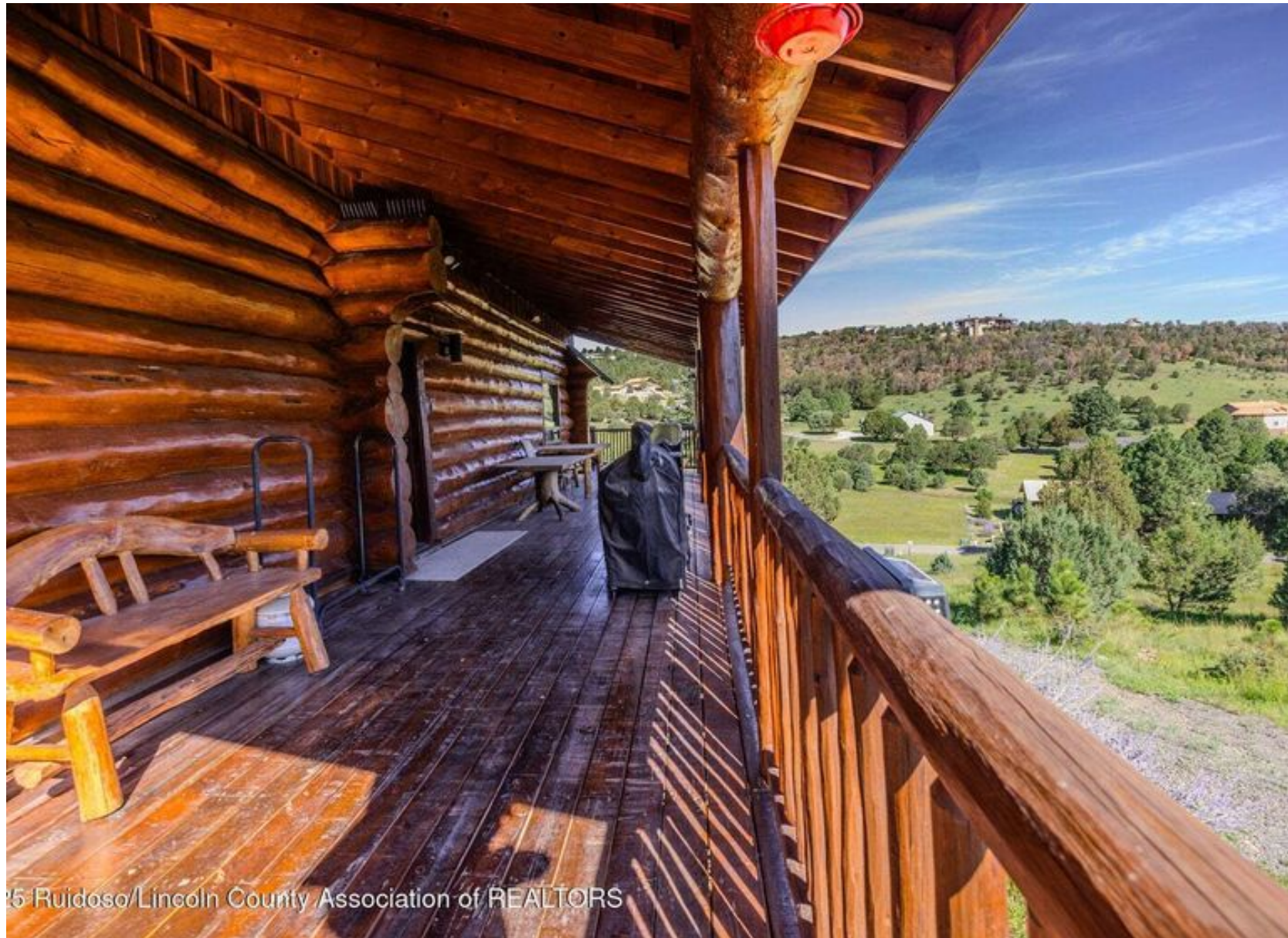
25 Ruidoso/Lincoln County Association of REALTORS