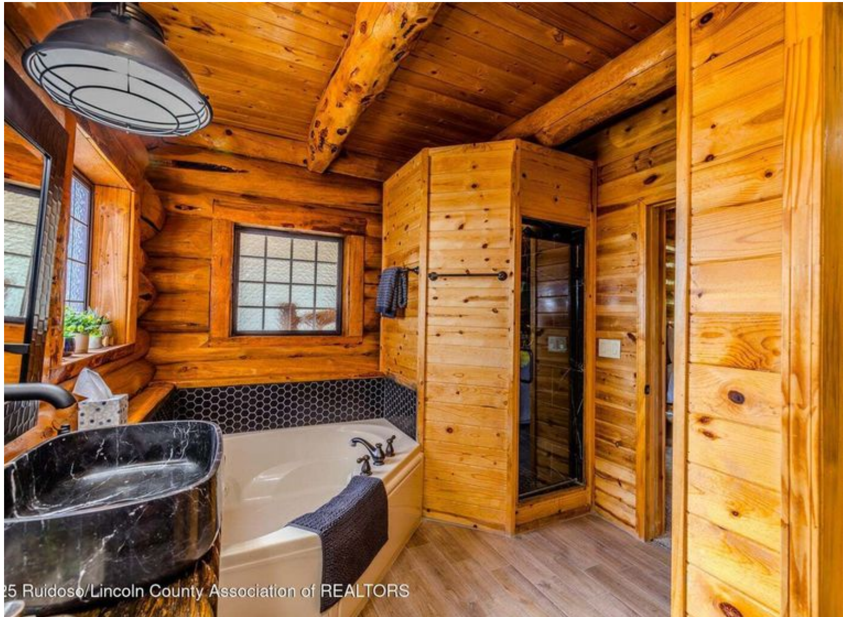
25 Ruidoso/Lincoln County Association of REALTORS