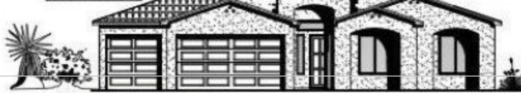
PITCHED FRONT ELEVATION