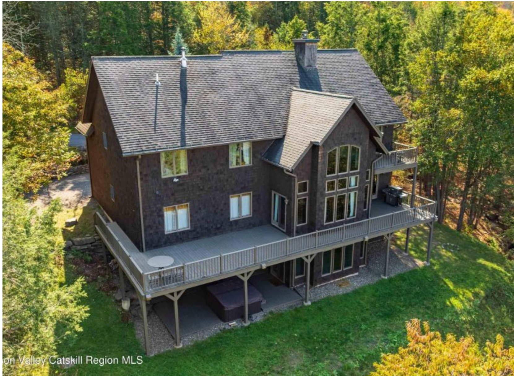
on Valley Catskill Region MLS