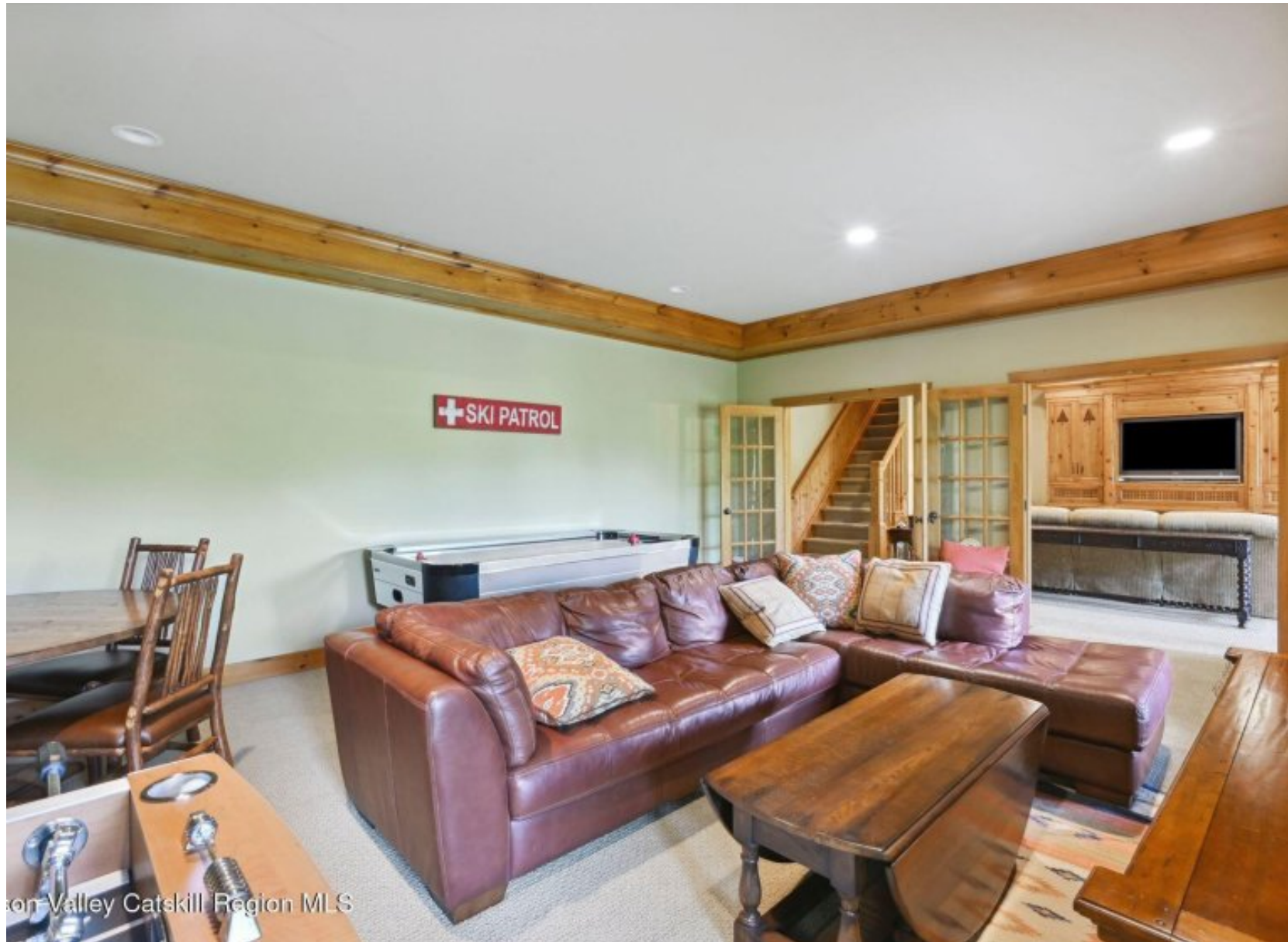
son Valley Catskill Region MI S