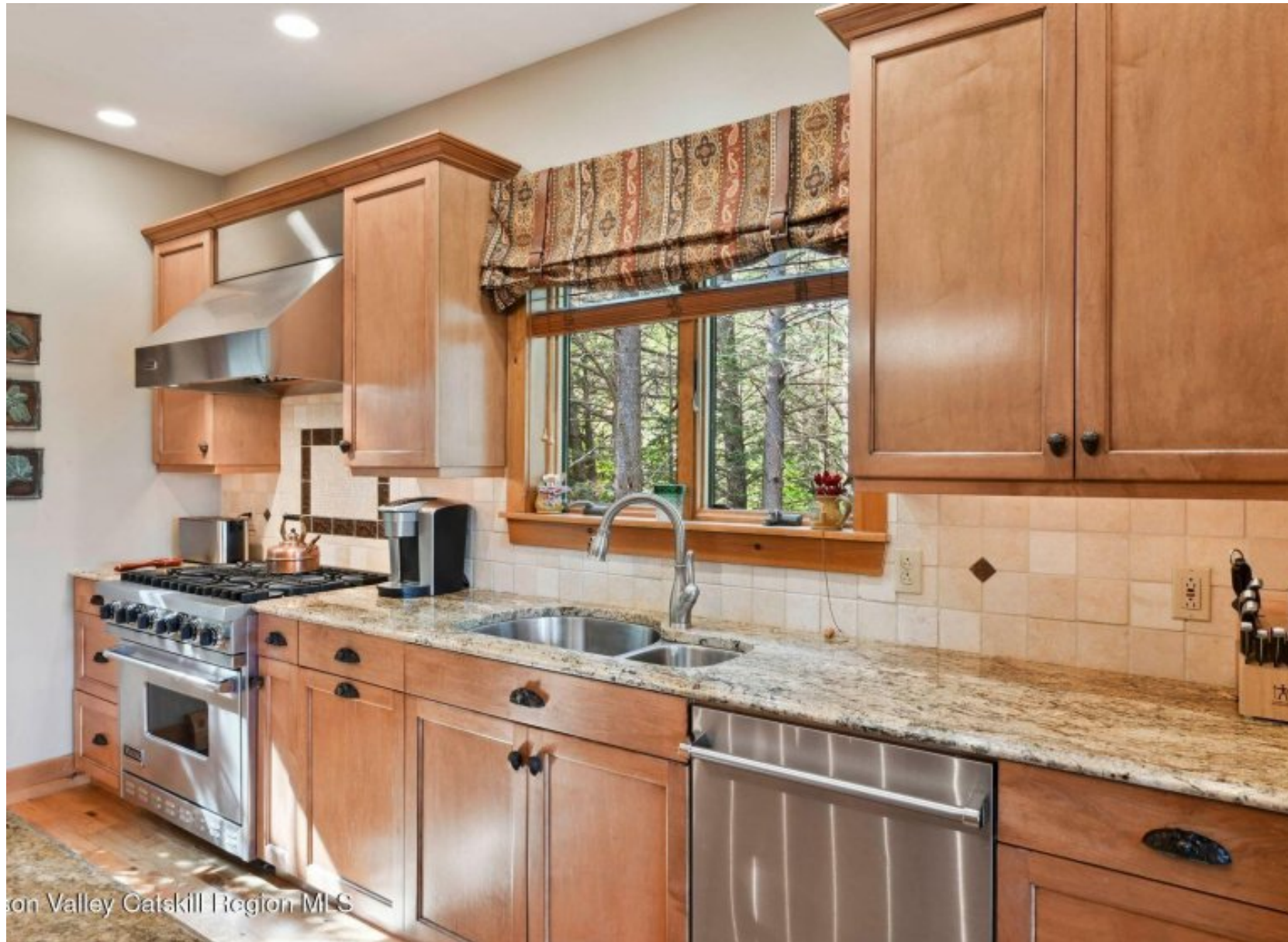
son Valley Catskill Region MLS