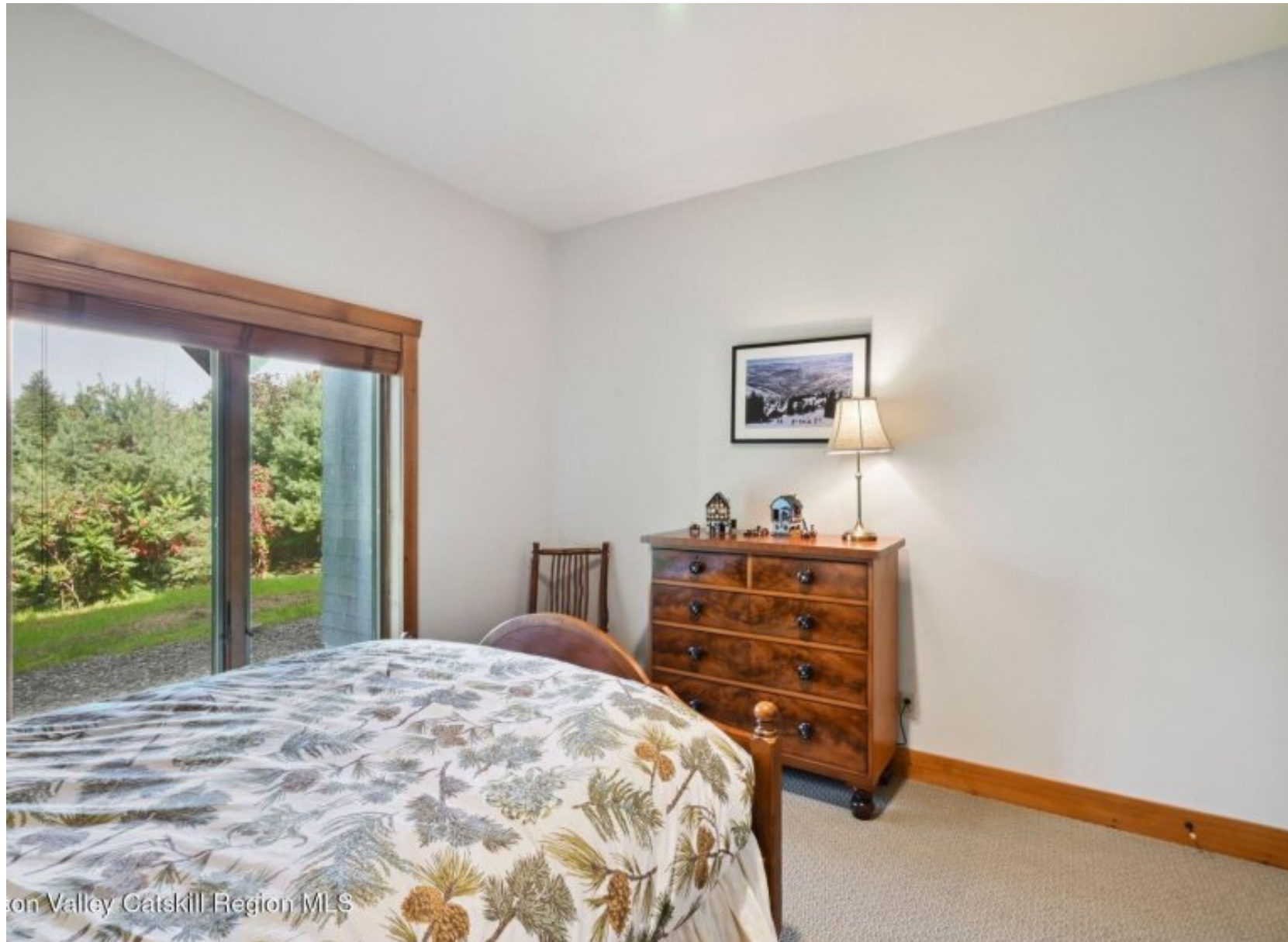
on Valley Catskill Region ML S