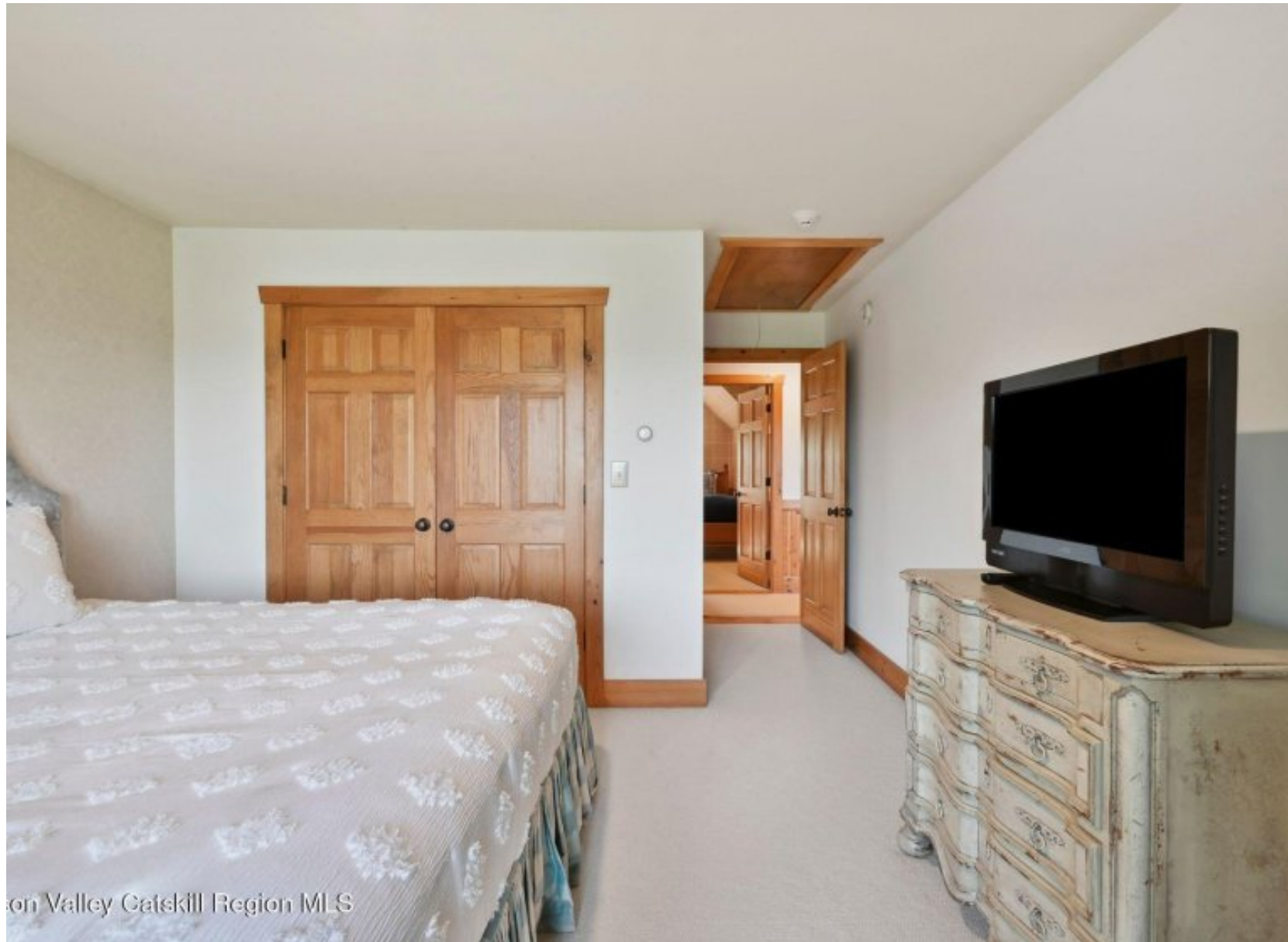
son Valley Catskill Region MI S