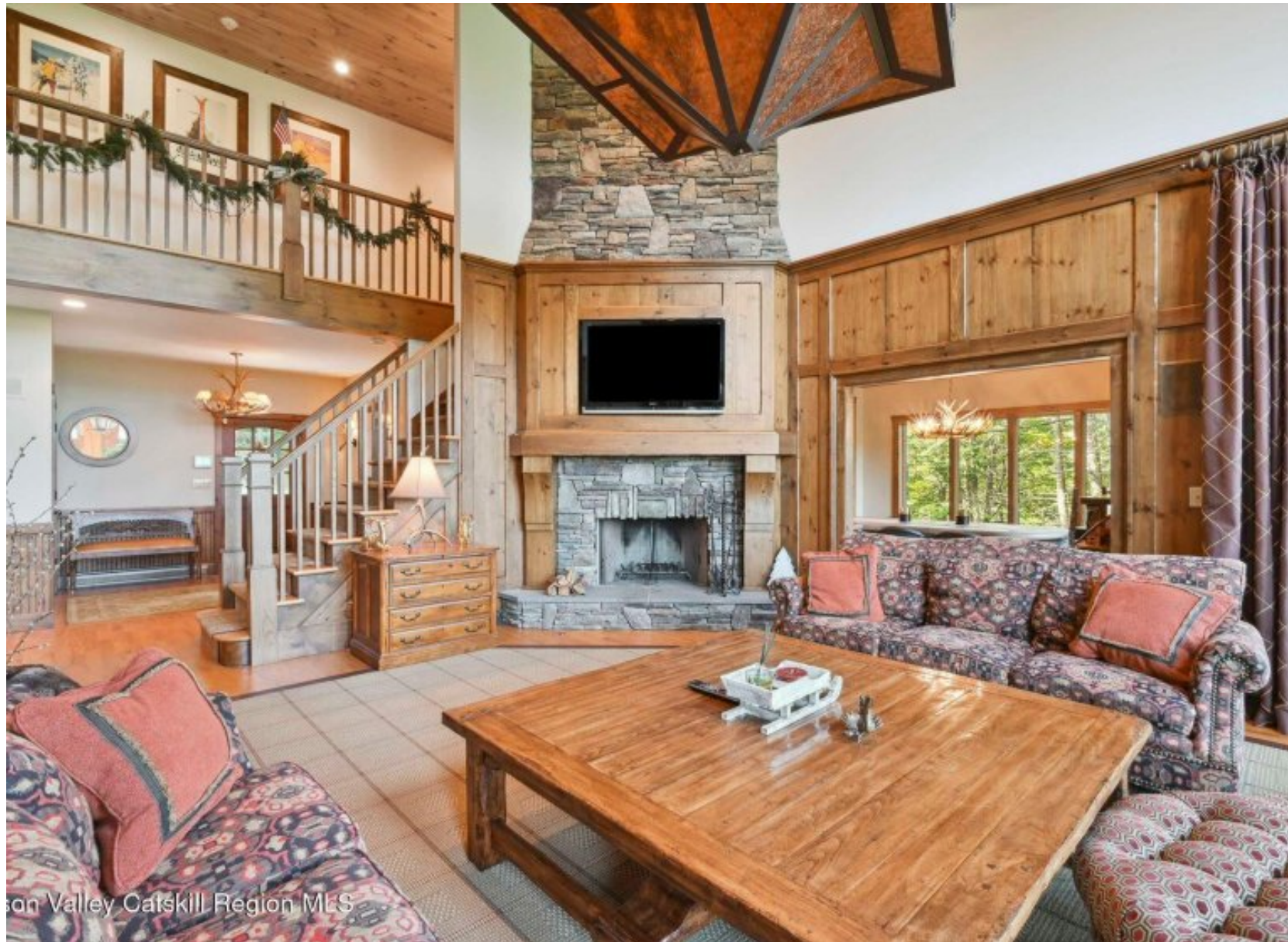
son Valley Catskill Region ML S