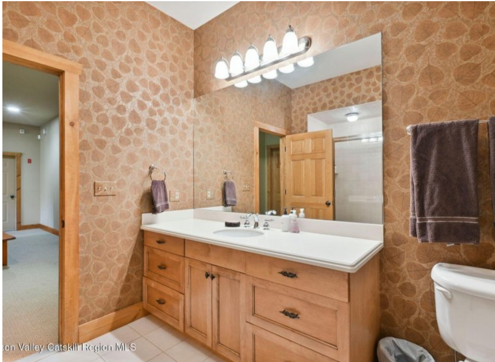
son Valley Catskill Region MI S