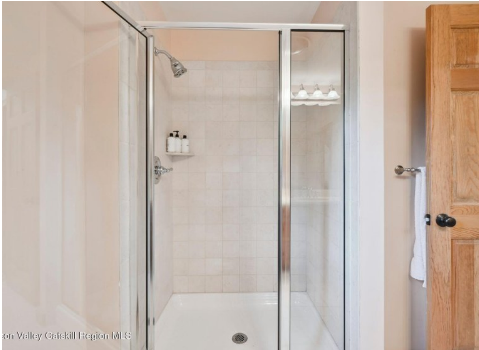
son Valley Gatekill Region ML S