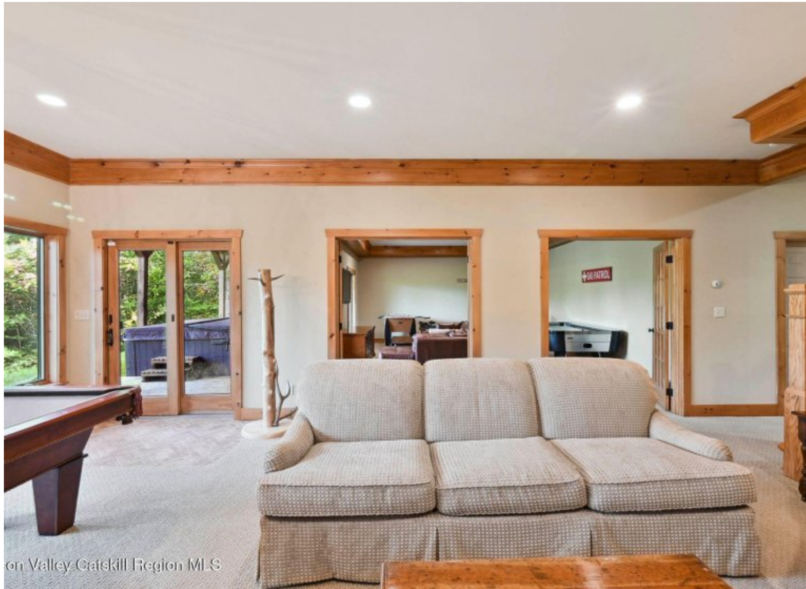
on Valley Catskill Region ML S