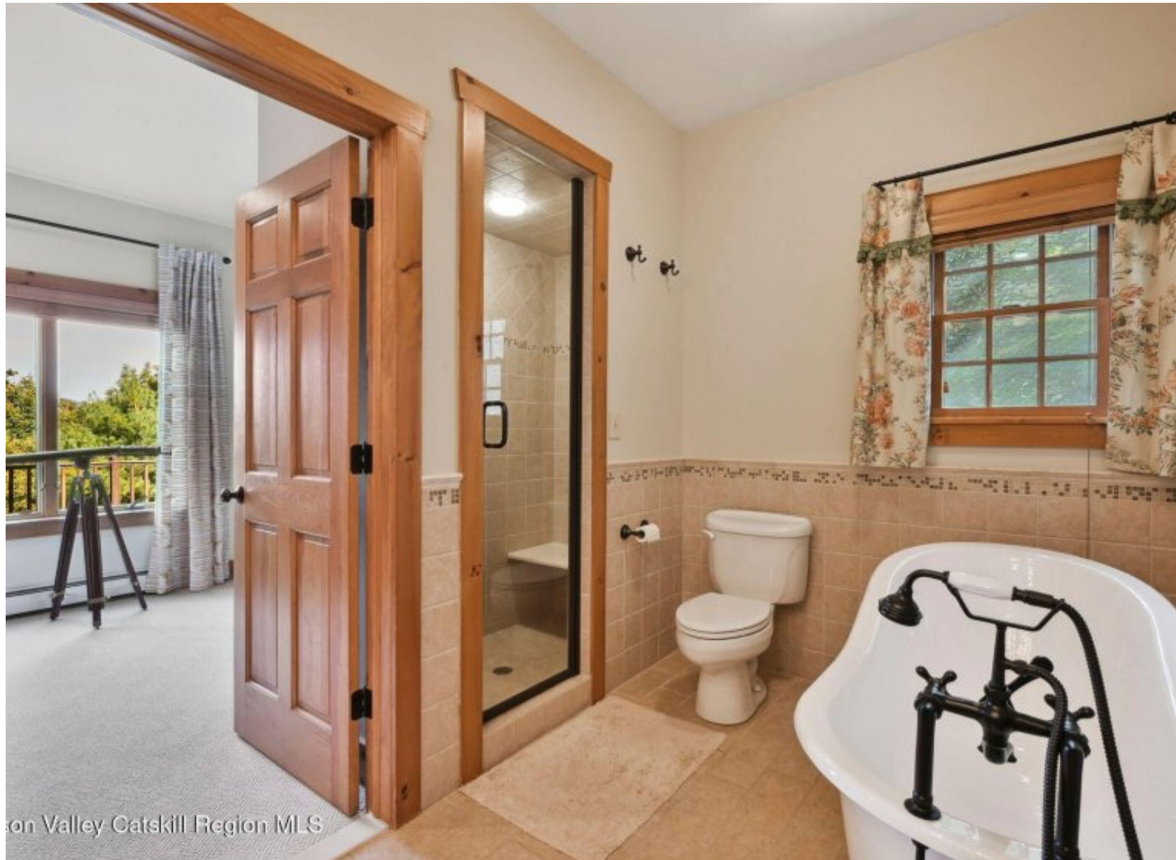
son Valley Catskill Region MI S