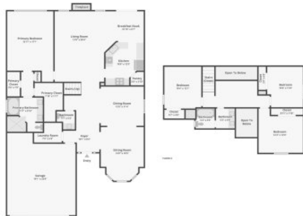
5 NEFMLS, Inc. Baltimore, MD, 21201, MD, 21201 This document is intended for use in the state of Maryland only. It is not valid in any other state.