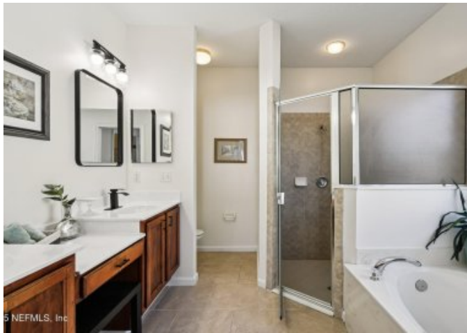
5 NEFMLS, Inc.