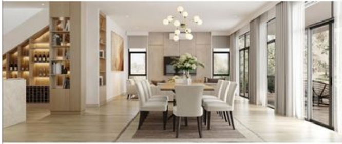
TYPE 1 INTERNAL PERSPECTIVE