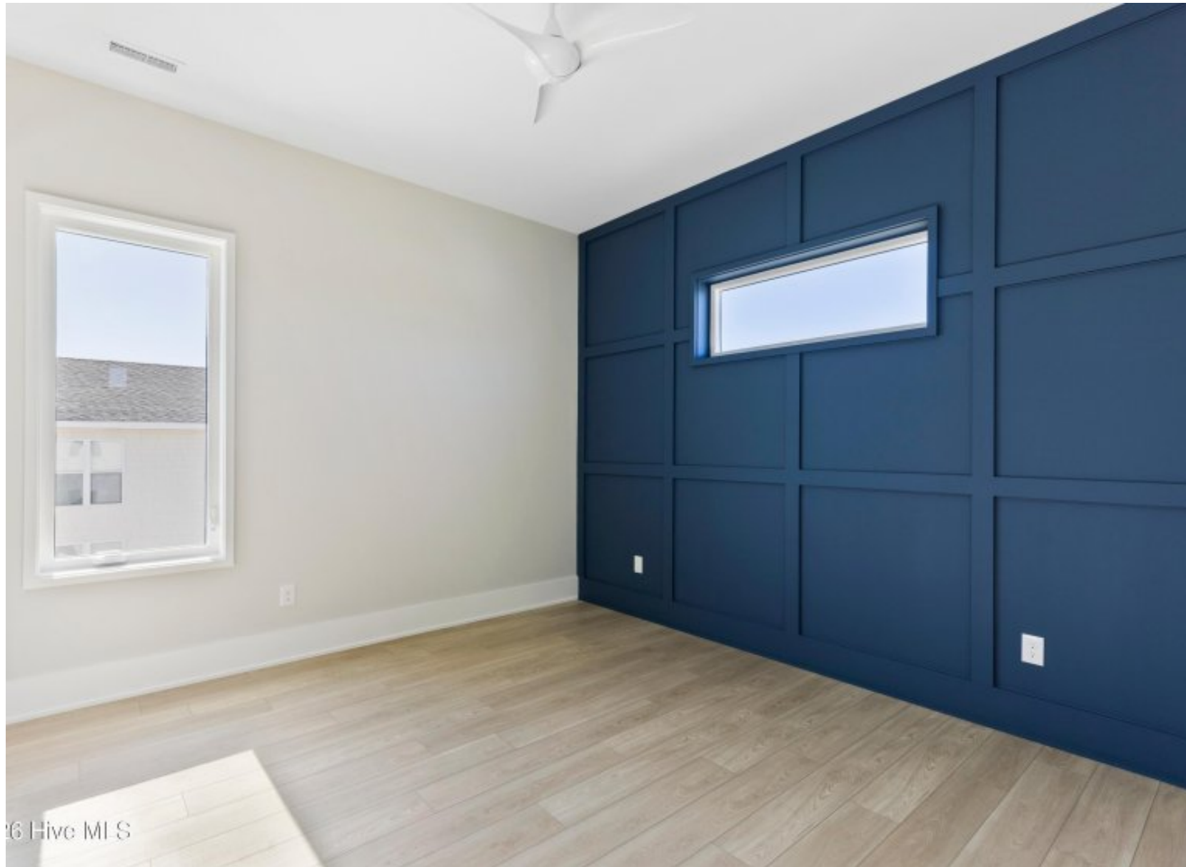
16 Hive MI S