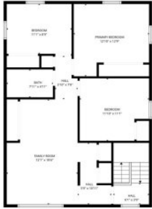
FLOOR PLAN PROVIDED BY COURTESY OF THE DEVELOPER. DIMENSIONS ARE APPROXIMATE AND SUBJECT TO CHANGE.