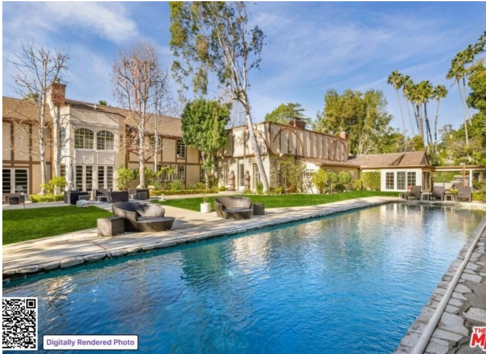
Digitally Rendered Photo