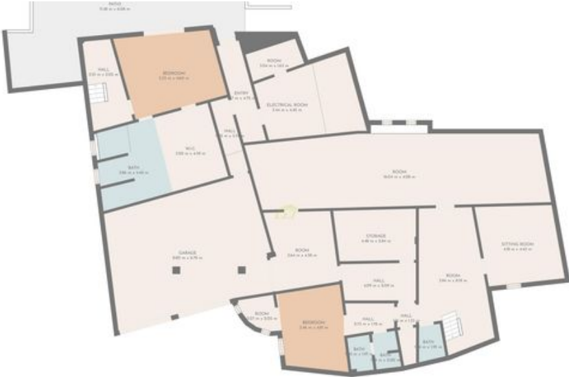
GROSS INTERNAL AREA FLOOR 1: 286 m 2 , FLOOR 2: 296 m 2