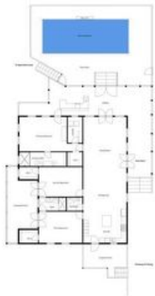
111-A Cotton Valley - Main Floor of the House

Hamptons International is not responsible for any inaccuracies or omissions in this information.