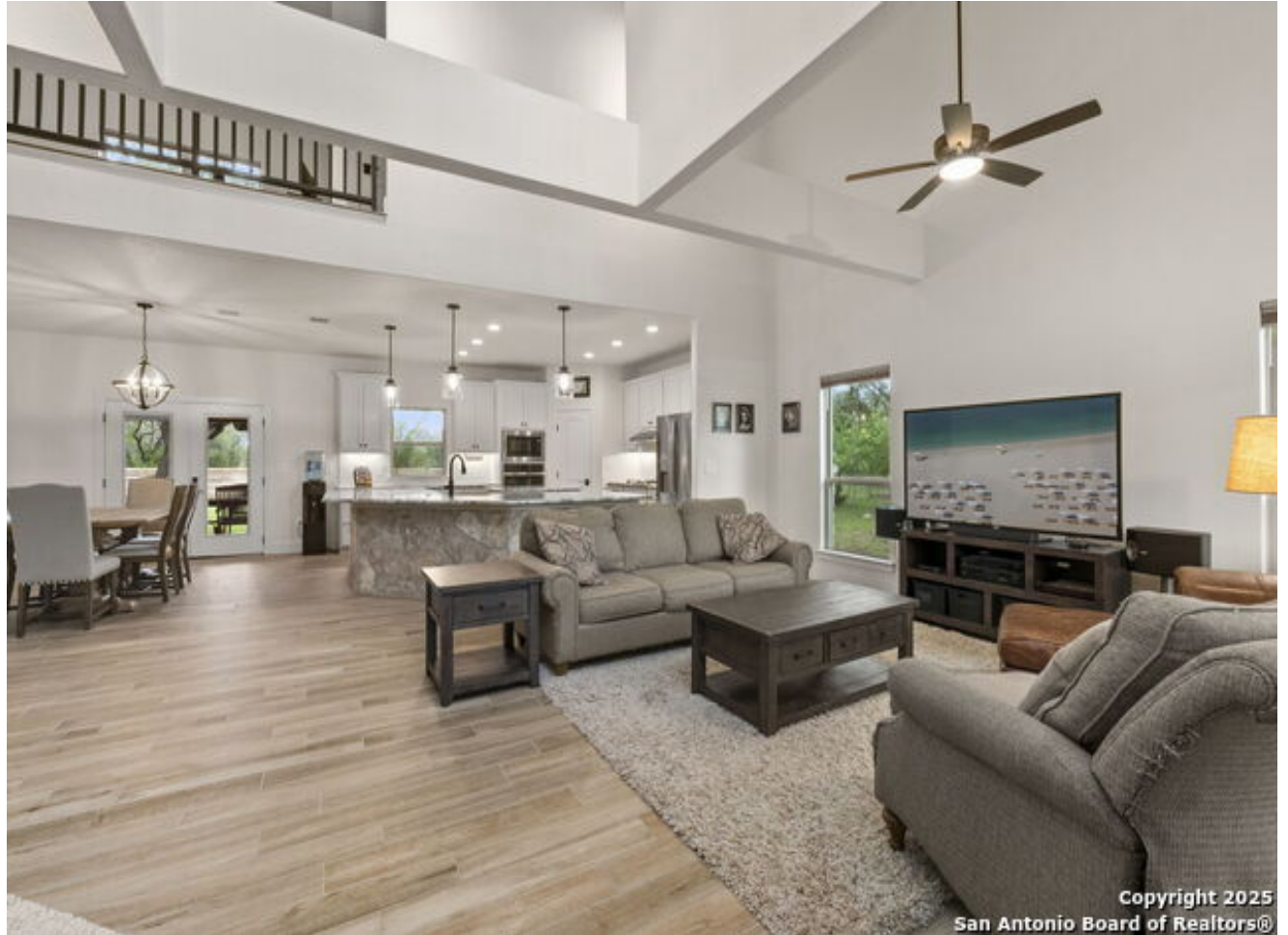
Copyright 2025 San Antonio Board of Realtors®