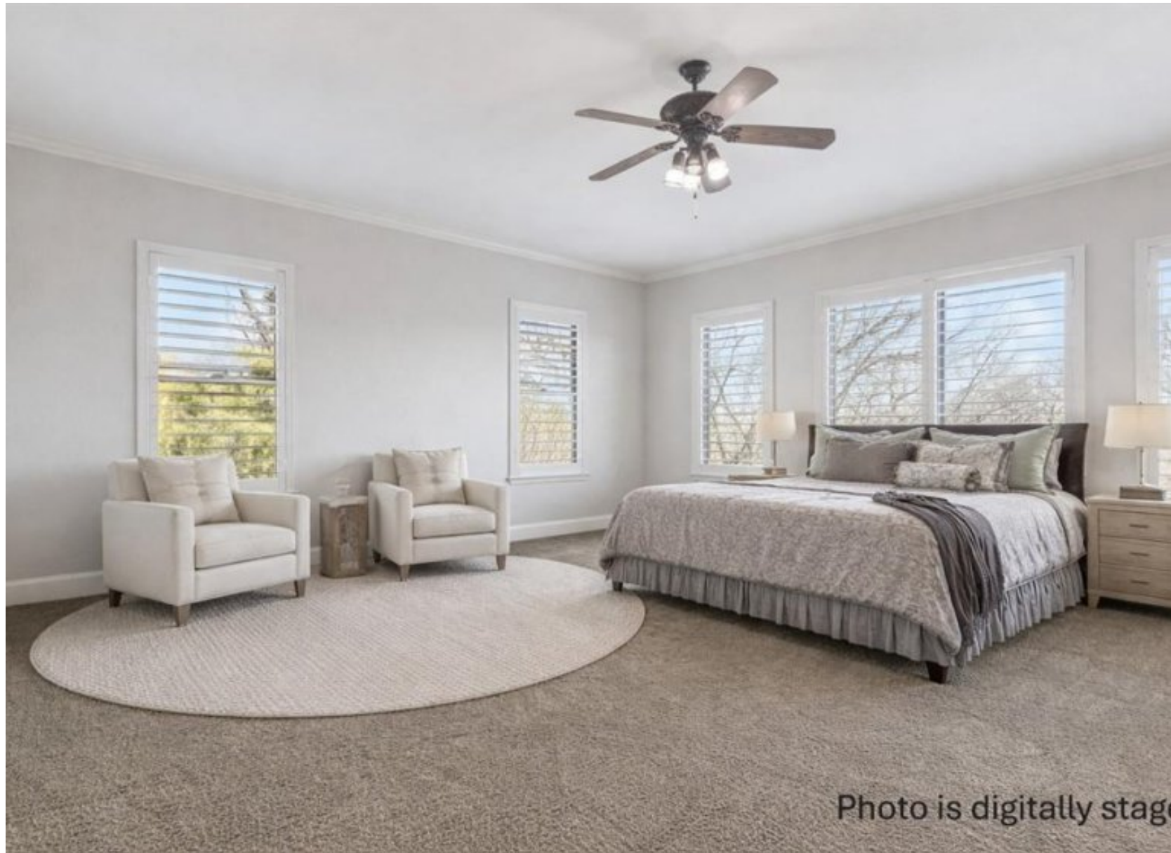
Photo is digitally staged