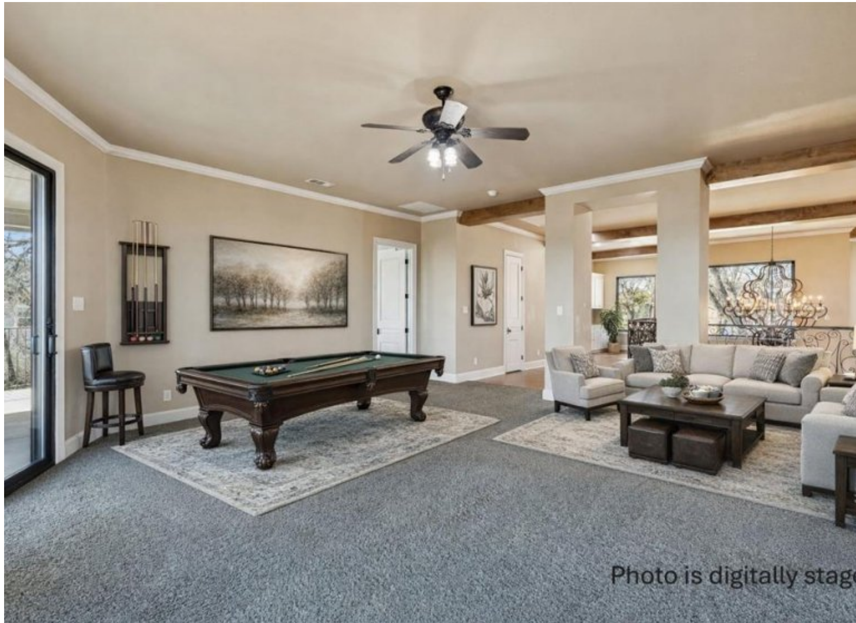
Photo is digitally staged