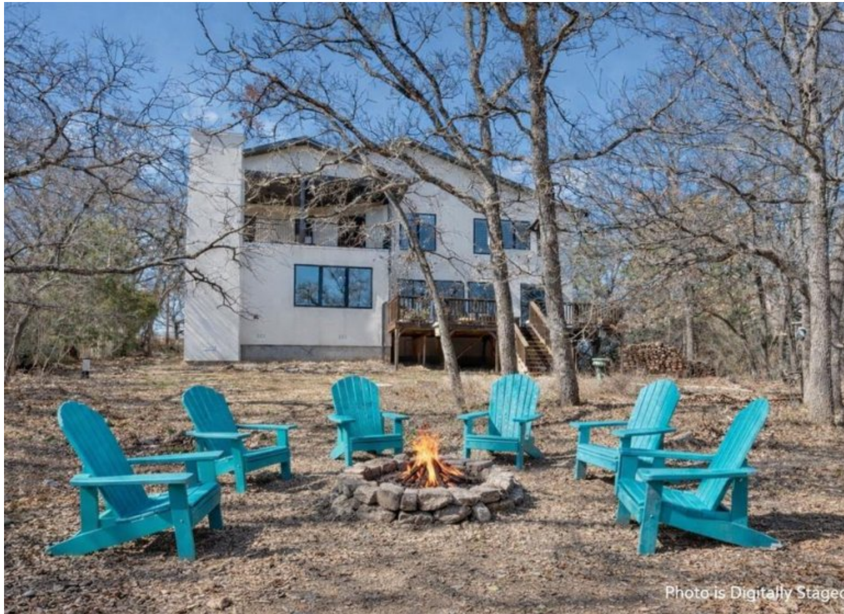
Photo is Digitally Staged