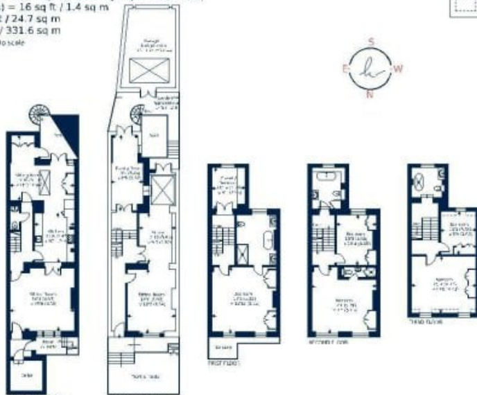
GROUND FLOOR FLOOR PLAN FIRST FLOOR FLOOR PLAN 1ST FLOOR 2ND FLOOR 3RD FLOOR

Not a structural drawing. For information only. Not to scale.