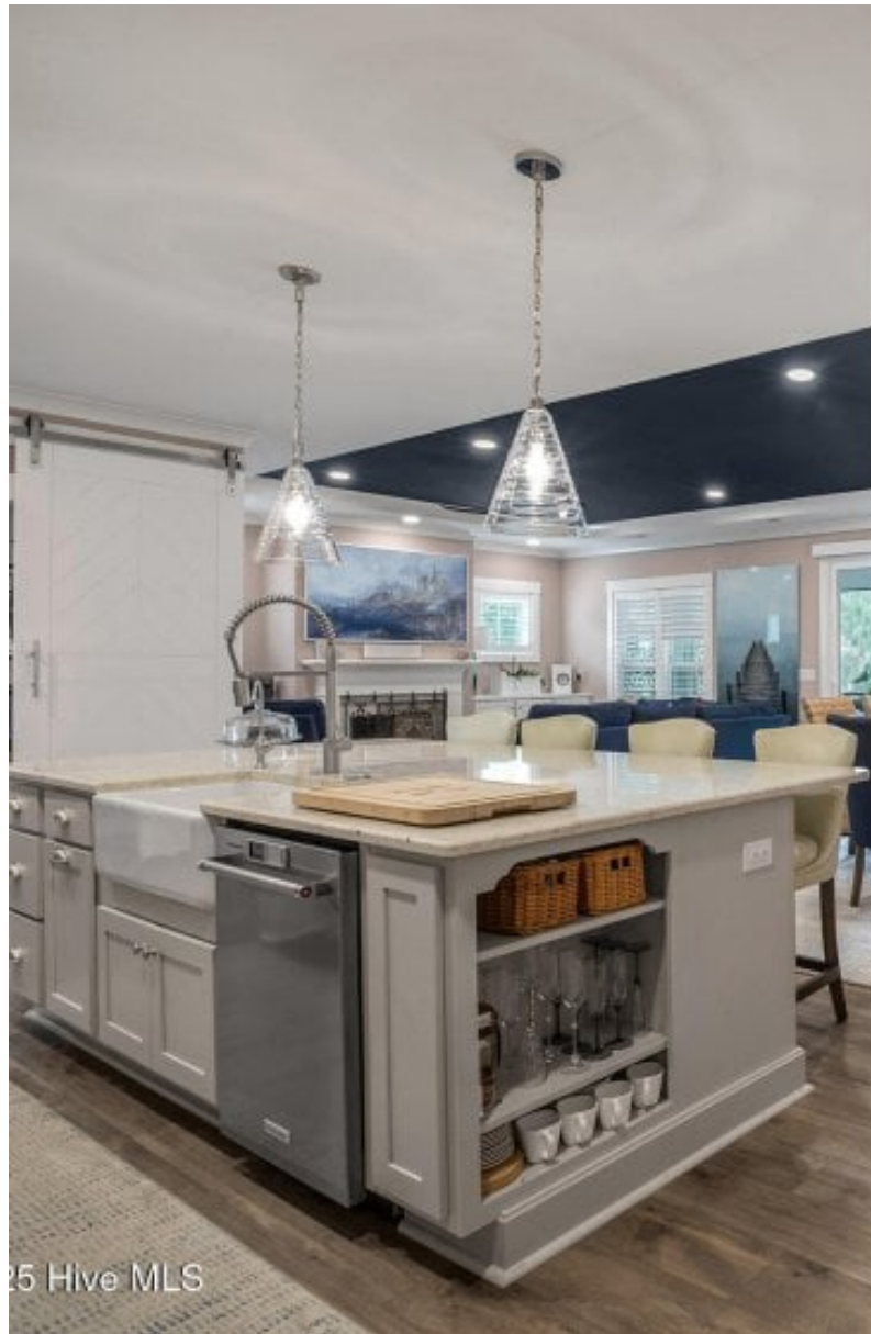
25 Hive MLS