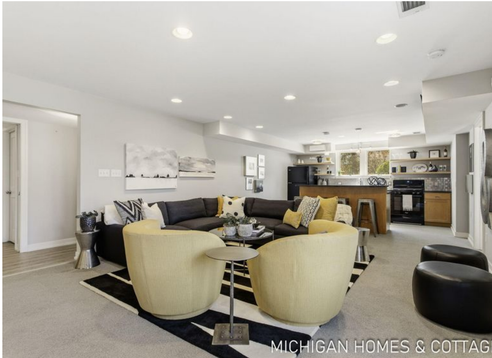
MICHIGAN HOMES & COTTAGE