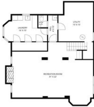
Plan View Created by Colliers Real Estate Services Limited. Measurements Taken on Site and Not Guaranteed.