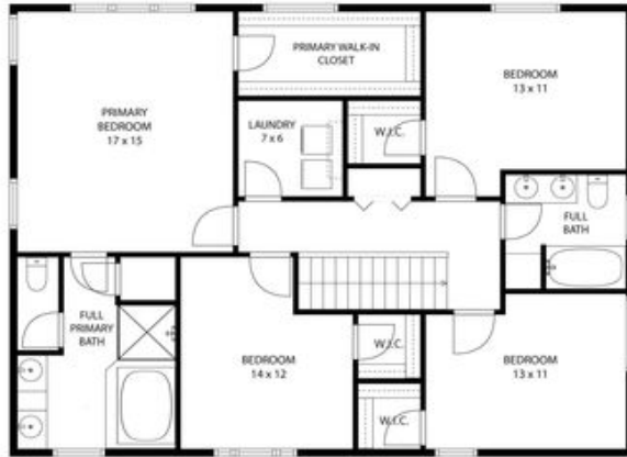
UPPER LEVEL FLOOR PLAN 20164 HARVEST DRIVE, LAKEVILLE MEASUREMENTS & DIMENSIONS CALCULATED BY TECHNOLOGY DEEMED HIGHLY RELIABLE BUT NOT GUARANTEED