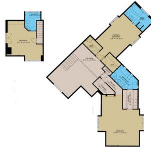
GROSS INTERNAL AREA FLOOR 0: 337 m 2 , FLOOR 2: 347 m 2 TOTAL: 684 m 2