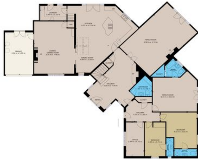
GROSS INTERNAL AREA FLOOR 0: 337 m 2 , FLOOR 2: 347 m 2 TOTAL: 684 m 2